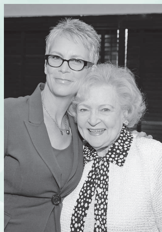
Jamie Lee Curtis, Betty White