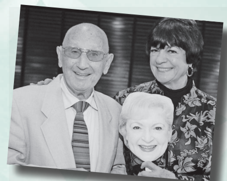
Bob Stewart, JoAnne Worley