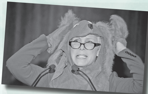
Jamie Lee Curtis