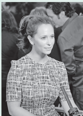
Jennifer Love Hewitt