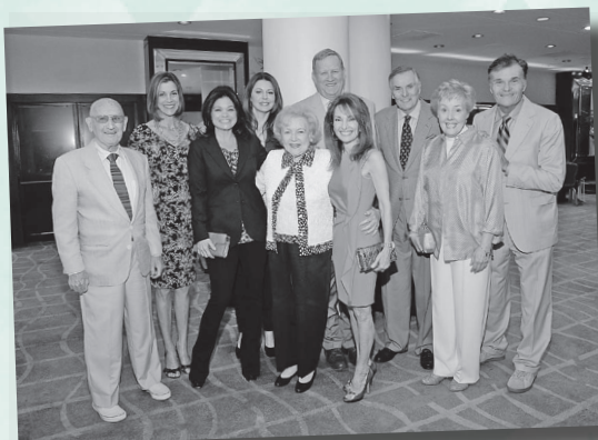
Bob Stewart, Wendie Malick, Valerie Bertinelli, Jane Leeves, Betty White, Susan Lucci, Ken Howard, Peter Marshall, Georgia Engel, Fred Willard