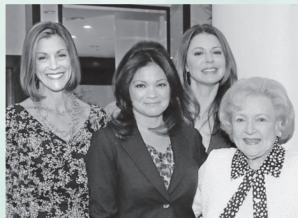
Wendie Malick, Valerie Bertinelli, Jane Leeves, Betty White