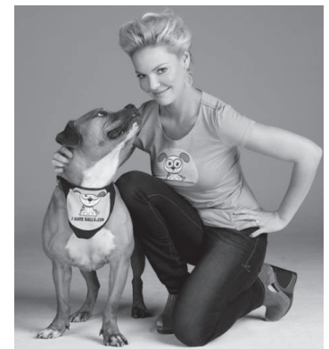
Katherine Heigl and friend

Helen Keller once noted that "Alone we can do so little; together we can do so much." Actors and Others is once again pleased to be working together with The Jason Debus Heigl Foundation on administering a new free sterilization program for dogs and cats in certain areas of Bellflower (90706), Santa Fe Springs (90670), South El Monte (91733) and South Gate (90280). This program will be funded by the Heigl Foundation in partnership with the ASPCA and administered by Actors and Others. Verification of residency will be required and limited to owned pets (no feral cats).