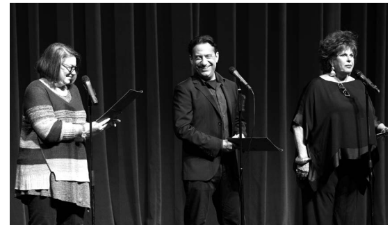
Mindy Cohn, Eugene Pack, Lainie Kazan

When Fred Willard announced “I will be reading from Justin Bieber’s second memoir ‘Just Getting Started,’” the audience howled with delight. Florence Henderson read from the autobiography of Mr. T and Lily Tomlin from that of Hedy Lamar with SNL alum Laraine Newman channeling Carol Channing and Lainie Kazan doing the same for Ethel Merman. Joey Fatone rushed over from the “Dancing with the Stars” set to take on “Don’t Hassle the Hoff,” the mesmerizing autobiography by David Hasselhoff. Of course, we couldn’t leave out the pets of the famous (yes there are “Dogobiographies.”). Mindy Cohn acted out Millie of the Bush